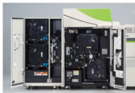
Quad magazine system