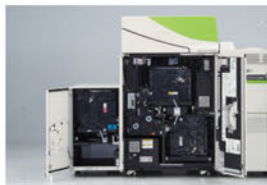
Triple magazine system

Replacing magazines every time you need to change print sizes can be a time-consuming task. But you can eliminate the need for frequent magazine changes by loading 3 magazines with the triple magazine system or even 4 magazines with the quad magazine system.